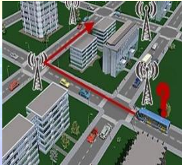
Fig2. Finding the best path to destination in city

Moreover a driver may need to buy anything from nearest store and even from a store with the lowest price. A message is produced by driver which contains the name of request and the position of vehicle that can estimate by GPS (Global Positioning System). This message will be sent to a RSU to find the best store. Then send a message to the vehicle which requested for it. In this way, not only driver can find the best and nearest store but also it can prepare a structure which costumers compare different options without need to park and visit several stores. This novel type of E-Business simplifies the life, leading to vast improvement in traffic jam, reducing the air pollution and saving time and cost.