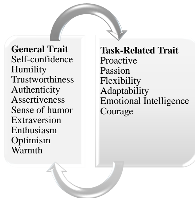
Figure 1 Characteristics of Leaders

Applying these characteristics to create a vision to execute consulting projects is challenging as environment, project, and the people you work with are constantly changing. Therefore, great leaders should do exceedingly well in adapting to different tasks and situations and with different mixes of people around them. Overall, a combination of these traits is the foundation to a pathway of success in engineering consulting.