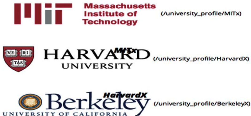
Figure 3. EdX (Screenshot)