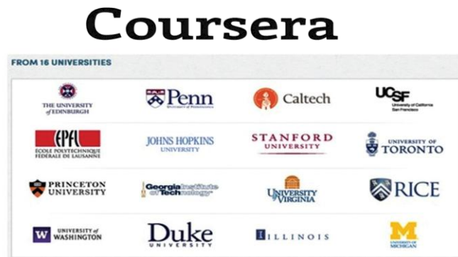
Figure 2. Different Coursera (Screenshot)