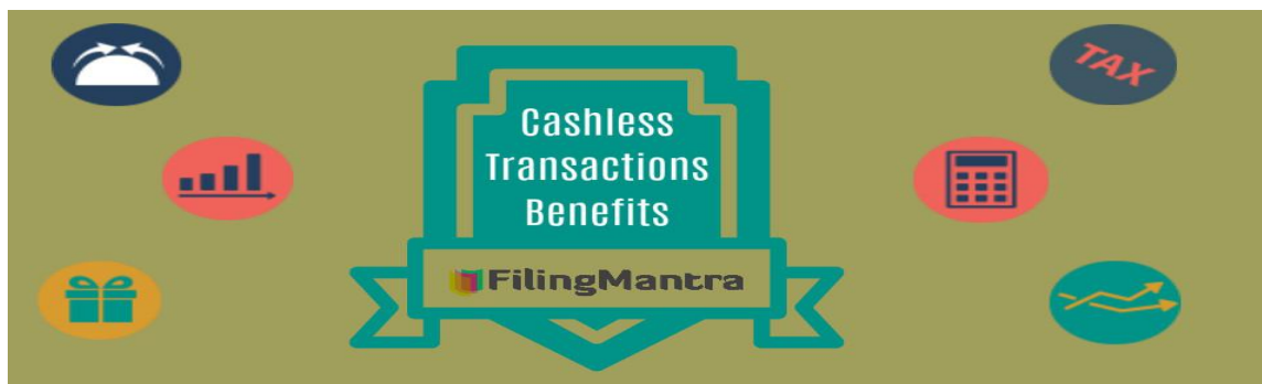
Figure 2: Benefits of Cashless Transactions

The cashless system which is cultured to the use of e-payment increases profitability through the following ways: