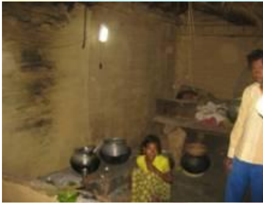
Fig.2 Solar home light system in kitchen

generation. Under such circumstances the only alternative was non-conventional power generation. Salepada possesses sufficient shadow free open space and receives adequate solar insulation for about 300 days a year. Average sunshine hours per day are around 6-7 hours. Thus the SPV power plant was better suited to the locale. A 2 kw size SPV plant was established. Number of Home lights installed was 85 along with 8 lights for street illumination of the area. Each home received 9 watt CFL for illumination purpose. Besides for community use 5 extra points including a TV point and 8 streetlights of 11 watt each were provided. A 2 Kw PV power plant can easily cater to the total load of 0.944 Kwp. Illumination for 5 hours per day, 5p.m.-11p.m., had been fixed. The supplier took up the responsibility for post-operation and maintenance of the plant in the coming decade.