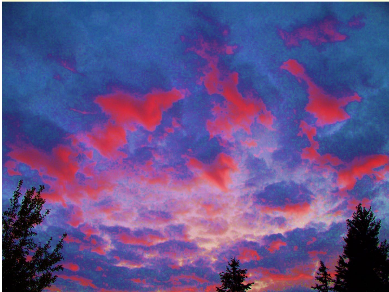
Figure1 cloud computing environment

Below diagram shows how our environment gets polluted with viruses. In cloud computing, the word cloud is used as a metaphor for "the Internet," so the phrase cloud computing means "a type of Internet-based computing," where different services -- such as servers, storage and applications -- are delivered to an organization's computers and devices through the Internet.Figure1 shows cloud computing environment .Cloud computing is comparable to grid computing, a type of computing where unused processing cycles of all computers in a network are harnesses to solve problems too intensive for any stand-alone machine[2].