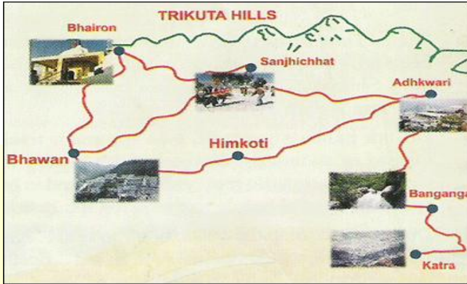
Figure No. 1 Guide Map of Vaishno Devi Shrine from Katra (The Base Camp)

Mata Vaishno Devi Shrine is attracting nearly 07 million pilgrims every year with a roughly annual increase of 10-12% pilgrims at a daily average of 18,000 to 19,000 pilgrims every day .The arrivals of tourists are shown in Table: