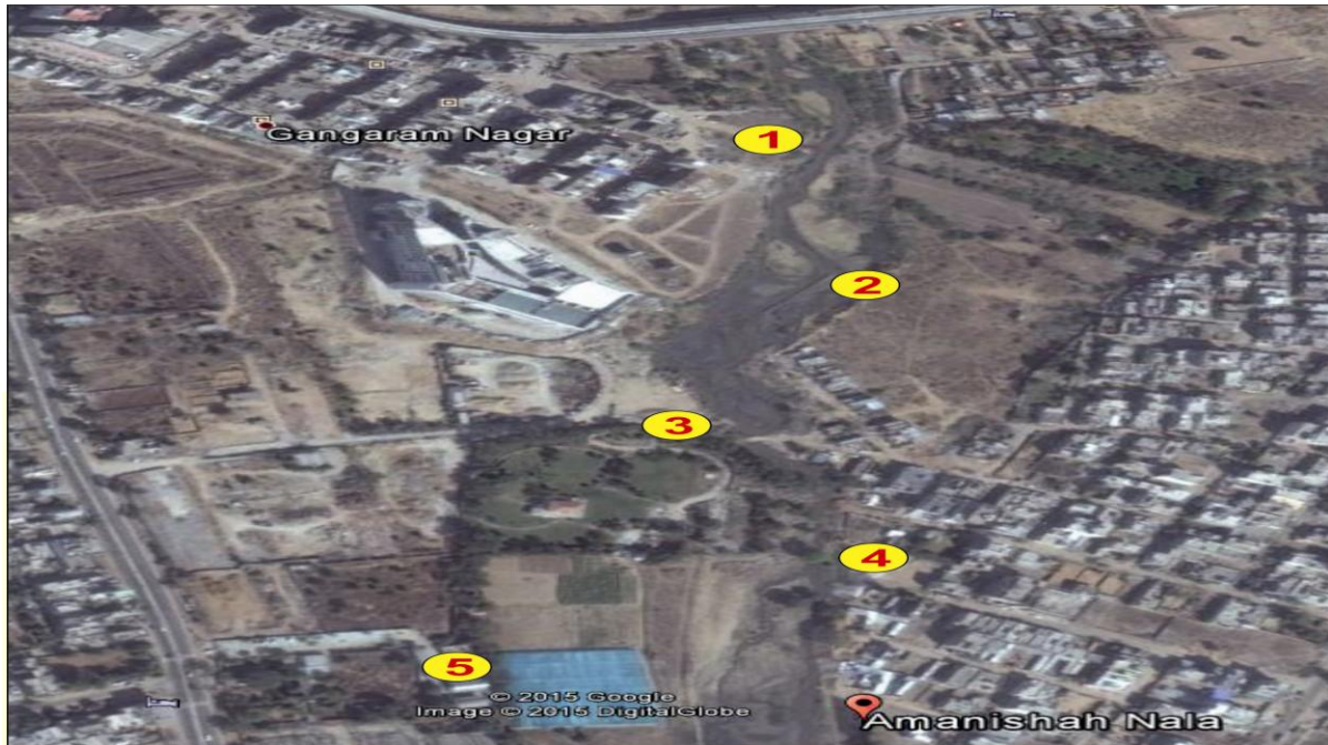
Fig 1, Shows the sites in the study area for collection of soil, water and crop plant samples at Sanganer, Jaipur