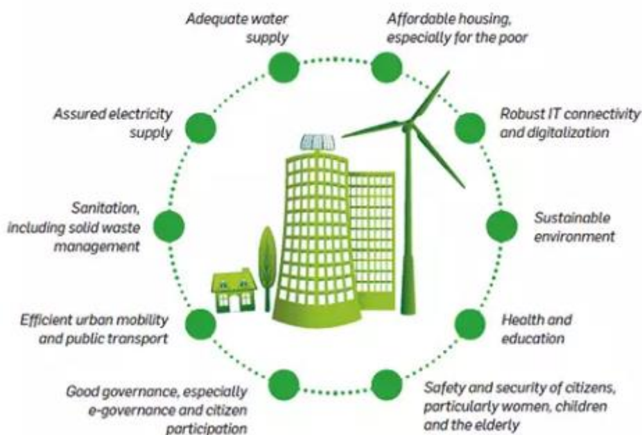
Figure 1: Green Marketing

A lot of composing is open as for green advancing, green things and purchaser care with respect to green things and perspective on green things independently. There are several examinations of combined undertakings concerning purchaser care and perception with respect to green things: Rex (2007) found that green exhibiting could take in package of things from normal publicizing in finding unexpected strategies in comparison to naming to propel green things like watching out for a progressively broad extent of buyers, working with the arranging techniques of significant worth, spot and headway and successfully charming in market creation. Hassock (2008) sent in Marketing Daily that "the power of green lies in sponsors' grip". It was not originators, legitimate consultants or officials that had the most ability to clean up the earth. The inventive individuals who can structure and propel cleaner things and advancements and help purchasers create to continuously conservative lifestyles. An investigation of the customers who had experienced getting green or natural things in Taiwan and found that green thing quality and green corporate picture could bring green buyer devotion and green customer unwavering quality. Ali (2011) surveyed the green purchase disposition and found that there are various customers who have positive and high objective to purchase green things. Costs