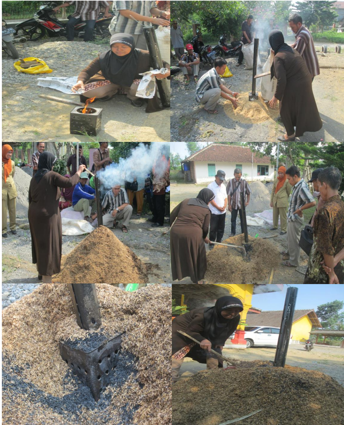
Figure 1e : Simple installation of biochar production