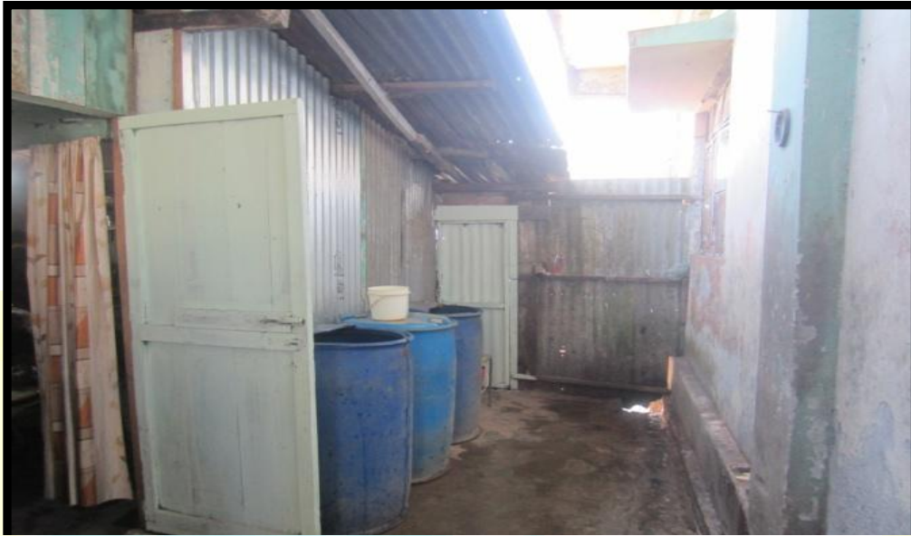
Tea labour store water for their household purpose in Kurseong

(Picture courtesy Lopamudra Ganguly date: 13.10.2015)