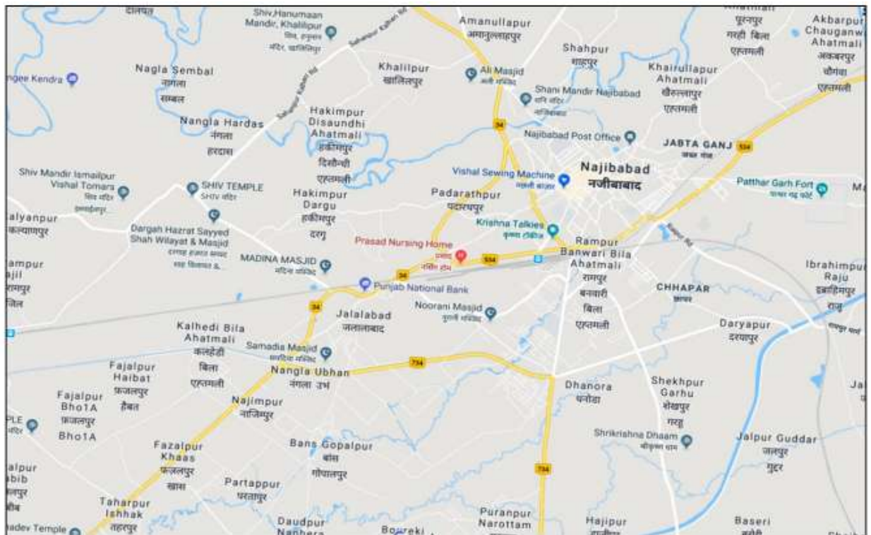
Figure 1 Map Showing the city Najibabad and the village around the city.

The investigation was directed at city Najibabad (Figure 1) in Bijnor region of Uttar Pradesh. Bijnor, or all the more effectively Bijnaur possesses the north–west corner of the Rohilkhand (somewhere in the range of 29°2' and 29°57' North scope and 77°59' and 78°56' East longitude) and is generally three-sided stretch of country with its vertex to north. The western limit is shaped all through by the profound stream of the waterway Ganga. Different waterways in the locale are the Kho, Ban, Gangan, Karula, Malini, Chhoiya, Pili, Ghosan, Dara Panaili, Dhink, Pandhoi and Ramganga. The locale might be depicted geologically as plain parcel with slight undulations brought about by the valley of few streams. The summers are extremely blistering while winters are genuinely cool. In summer, the temperature goes upto 44°C in the period of May and June with drying up dust-clearing twists privately known as "Loo". The variety in temperature is seen from one season to another, and month to month.