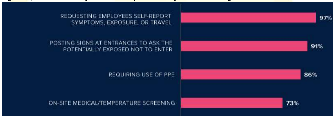
Figure (1): Health & Safety Measures Implemented by American's Organizations

In a research on the costs of COVID-19, which was done by SHRM and Oxford Economics in May 2020, their findings show that as U.S. workers have lost an estimated $1.3 trillion—roughly $8,900 per worker. It seems high shock to the international economy generally and the American economy is specifically (SHRM Research, 2020).