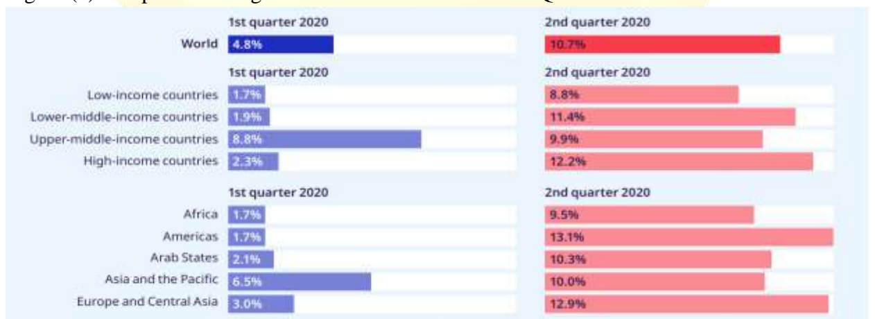
Figure (3): Drop-in Working Hours in the First and Second Quarter of 2020.

Therefore, when some countries started to adopt intensive testing and tracing, their businesses and organizations start to reopen and they improve the working hours as appeared in figure(1). This result also indicates that applying the international measures, standards, and practices related to health and safety might lead to improving the working environment and thus the labor market's outcomes.