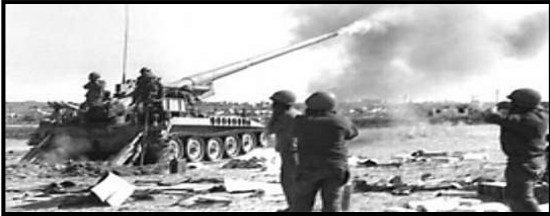
Figure 1.1 Israel Defense Forces troops firing at Syrian targets on the northern front during the 1973 Yom Kippur War.