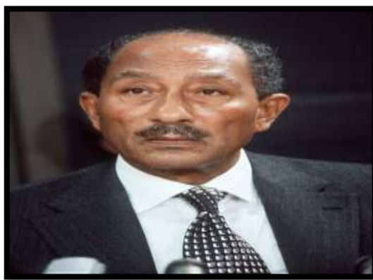
Figure 1.4 Anwar Saddat the former Prime Minister of Egypt.

As a result, with broad popular support, Congress committed to significantly increasing foreign aid to Israel to boost its military and economy capabilities. In 1971, United States provided Israel with $545 million in military aid, up from $30 million in 1970 (Takin. M, 1997). In 1971, Congress was the first to allocate a precise sum of money to Israel. The Commodity Import Program (CIP) for American commodities replaced project funding, such as support for agricultural development activities (Willner. S, 2018). The US took over the role that France had ceded after French President Charles De Gaulle declined to equip Israel with military weapons in protest at the country's pre-emptive commencement of the June 1967 War (Varisco. D, 2009). In 1976, Israel became the United States' largest receiver of foreign aid. 1971 until today, the United States has provided over $2 billion in annual funding to Israel, with military assistance accounting for two-thirds of the total (Sobel. R, 1974).