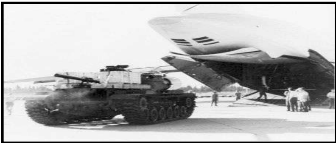
Figure 2.3 M60 tank unloaded from a USAF C-5 Galaxy during Operation Nickel Grass

Even when inflation is considered, U.S. yearly contribution to the Middle East in decades after WWII was a minuscule fraction of current aid disbursements to the area, under dramatic different geopolitical conditions, US strategy was focused on assisting oil-producing nations in their growth, maintaining a neutral stance in the Arab-Israeli conflict while protecting Israel's security and limiting Soviet influence in Iran and Turkey (Ehnsio. R, 2001). In 1950s and 1960s, US officials employed foreign aid to achieve these goals (Sharp. J.M, 2010).