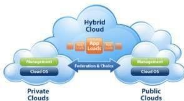
Figure 1. Development Model of Cloud Computing

Which cloud model is chosen for secure cloud services is of utmost importance. In cloud computing, there are essentially three different deployment model types.