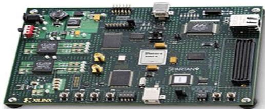
Figure 4. FPGA controller and interfacing circuit