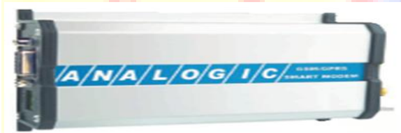
Figure 3. GSM Modem

VHDL test benches were designed to test all the developed VHDL code both at block level and at top level before downloading the synthesized code on the FPGA. The waveforms were checked to verify correct operation, both states and timings, of the hardware. The devices connected to the FPGA were also tested by forcing outputs and inputs and checking the functionality. All interfaced circuits functioned as expected. The communications channel had to be tested as well. A serial port monitoring program installed on a PC was used for this. A GSM wavecom was connected to the PC and the communication between mobile phone and the PC, the PC and the FPGA controller were tested. This was done by sending GSM commands and monitoring the replies. Once the controller and the GSM connection were tested, the whole system was tested exhaustively by sending commands and reading and noting the results. Images of the GPS wavecom screen are shown in Figure 3, while a image of the system which involves the central FPGA controller and the interface circuits is shown in Figure 4.