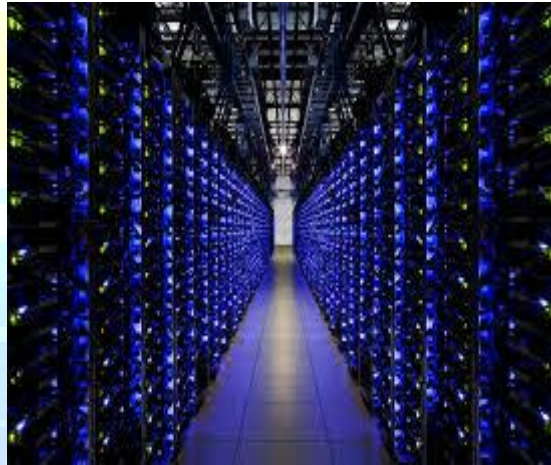
Fig 1: Data Center

A data center (sometimes spelled datacenter) is a centralized repository, either physical or virtual, for the storage, management, and dissemination of data and information organized around a particular body of knowledge or pertaining to a particular business. It generally includes redundant or backup power supplies, redundant data communications connections, environmental controls (e.g., air conditioning, fire suppression) and security devices.